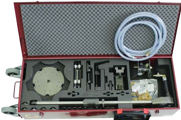
SLIM 300 transport box with accessories

High performance CBN (Cubic Boron Nitride) grinding heads.