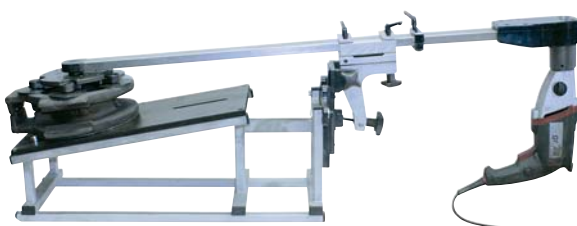
SLIM 300 grinding of gate valve wedge