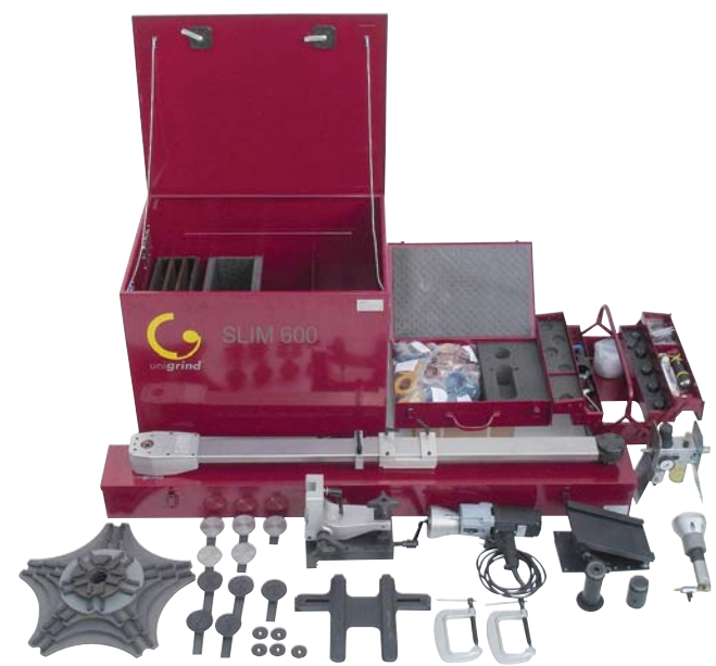
SLIM 600 Scope of delivery