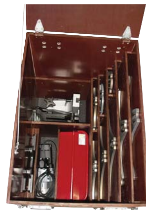
SLIM 1000 transport box with accessories