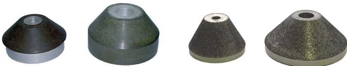
CBN Grinding cones