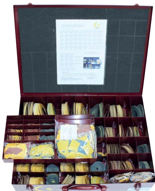
VENTA Transport box with abrasive set