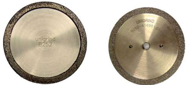
unigrind DIAPLAN BOR, grinding disk