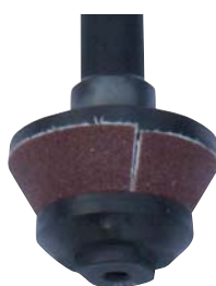
Grinding cone with abrasive