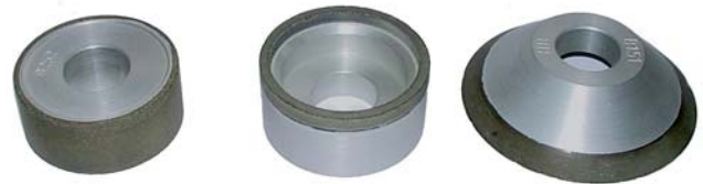
CBN Grinding stone for facegrinding or circumference grinding