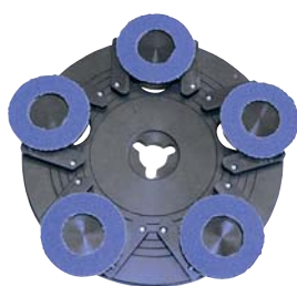
Planet disk with grinding rings