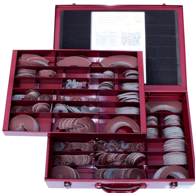
KVS Transport box with abrasive set