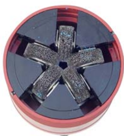
ARG Front view of the cleaning head