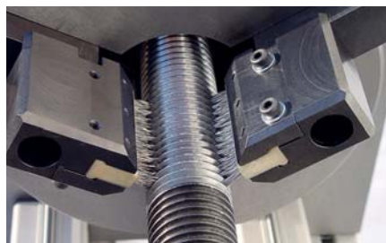
SAM Detail view