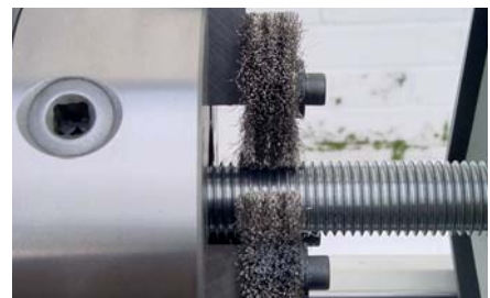
SAM Detail view